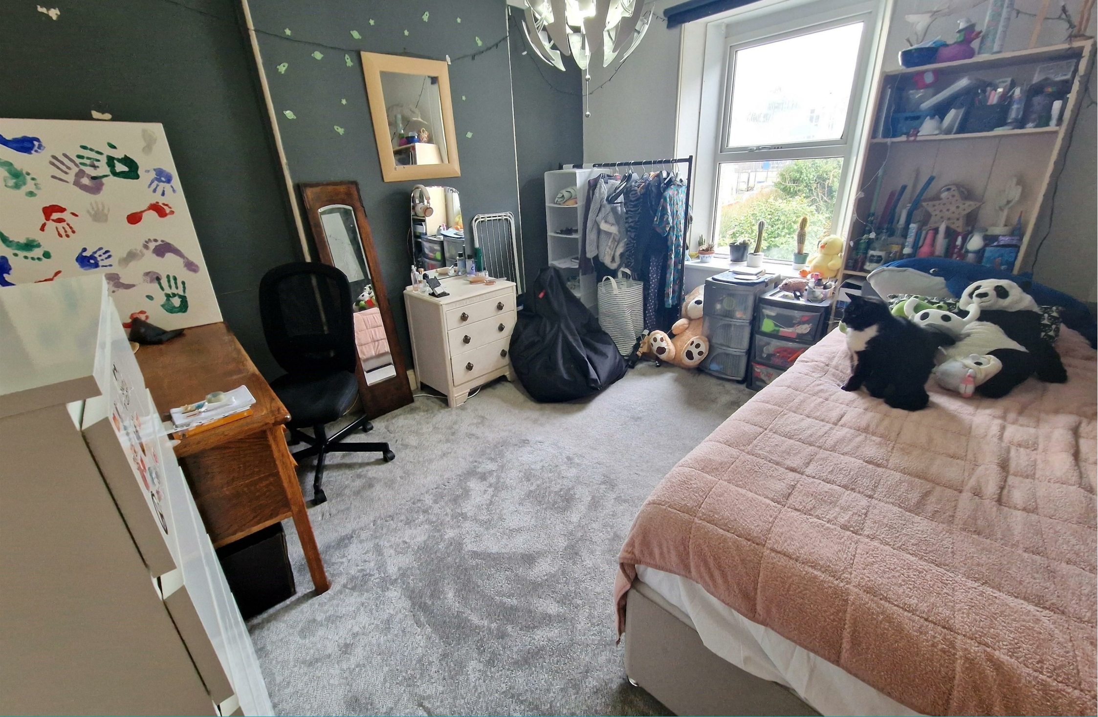
Dunheved Road, Launceston, PL15 9JH